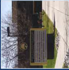
Mott Community College University Center 1401 E. Court St. Flint, MI 48503 810.762.0299