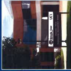
Macomb Community College University Center 44575 Garfield Rd. Clinton Twp., MI 48038 586.263.6288