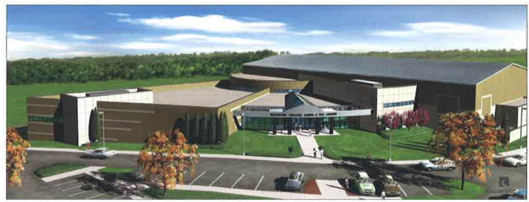
Concept photo of the planned Athletic Center, to be built at the far east end of the RC campus.

College students hopeful; sources say construction could begin as early as this fall