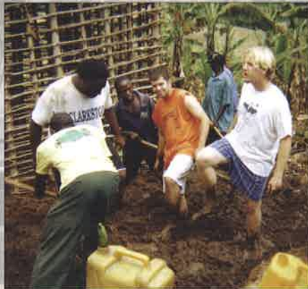
Members of the 2004 summer mission team to Uganda work with locals to mix mud for the floors of a new hut, being built in the background.