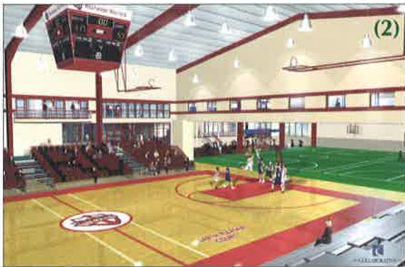
The concept drawings of the Athletic Center shown on this page include (1) a detailed aerial view of the plans, including athletic courts, a fitness center, and offices (2) the performance basketball court backing up to practice courts, and (3) an outdoor front-view sketch.

we have already accomplished. Think how much more can be achieved once our teams have the appropriate facility to aid them in their success." So far, the staff, faculty and administration at Rochester College have shown enormous support by pledging over $400,000 for the campaign. The employees of Rochester College recognize their involvement for what it truly is—an investment in their future. "The pledges given by Rochester College employees make it obvious they stand behind this campaign," says Robinson. "Their sacrificial commitment sets a standard for alumni and friends to 'catch the vision' and create a new reality for the Warriors. In this way, our employees lead by example." If current fundraising goals can be met, the College will break ground this year—and that will be a day that has been worth the wait.