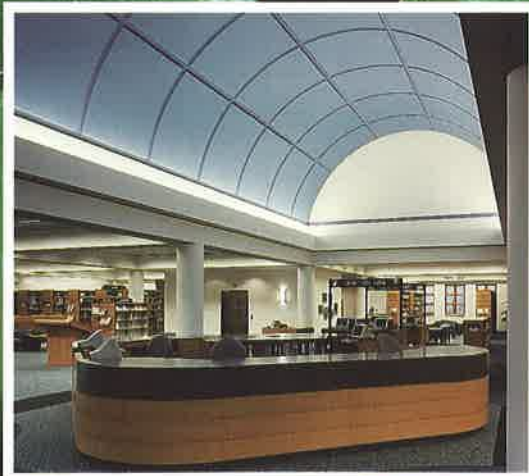
Rochester Hills Public Library