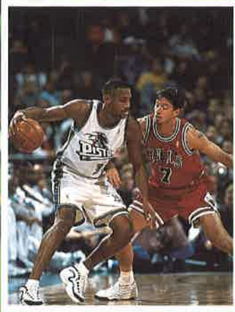
Pistons at the Palace