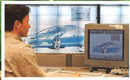
Chrysler World Headquarters