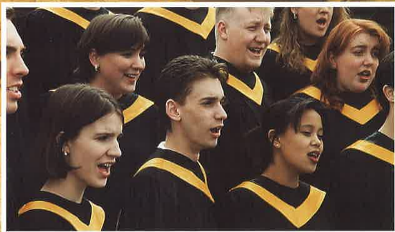
A Cappella Chorus