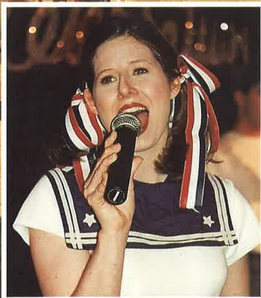
Celebration in Song