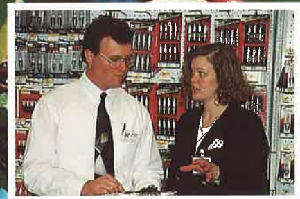
Marketing Internship Anatomy Lab