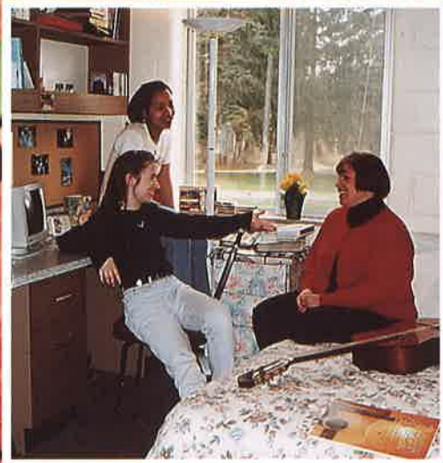
Residence Hall Life