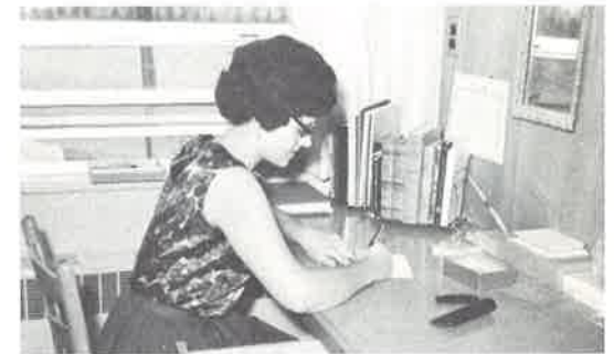
A pleasant, safe place to live and study brings out the best in any student