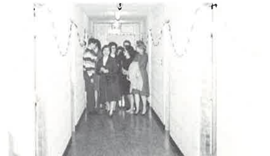
"Open House" in dormitories is always enjoyed by all