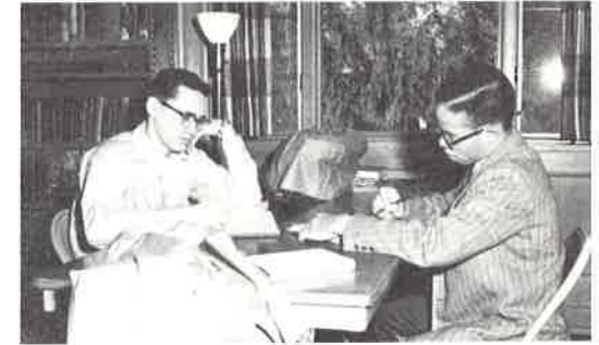
A good library helps students form good study habits

MCC desires to continue to provide the means of academic achievement of the highest quality. Therefore, projected growth during the months ahead demands the construction of the new Library Building.