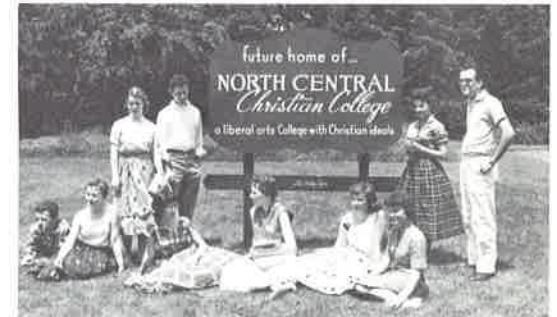
Future students anticipate first days of college operation.