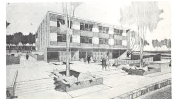
Proposed Library Building to house 50,000 volumes, plus study area