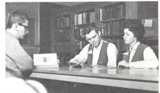
The varied interests and pursuits among students requires extensive research material