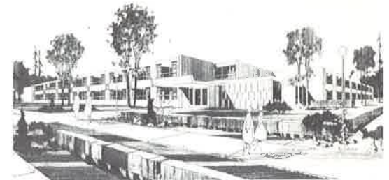
Proposed Women's Dormitory with capacity for 120 girls

This residence hall, housing 120 boarding women, must be built now if additional young women seeking a Christian education at MCC are to be admitted next year.