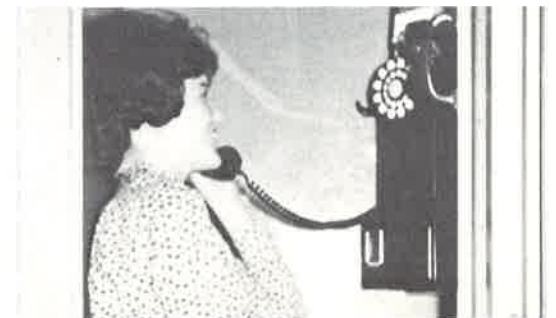
Boarding students feel the security of well supervised dorms by experienced staff