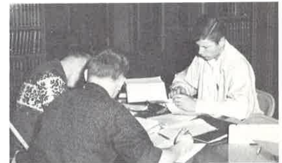
The college library is the center of academic activity