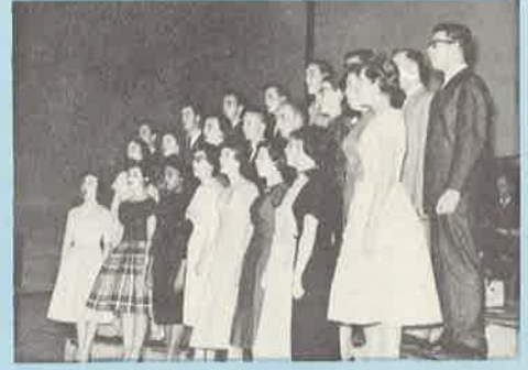
A CAPPELLA CHORUS