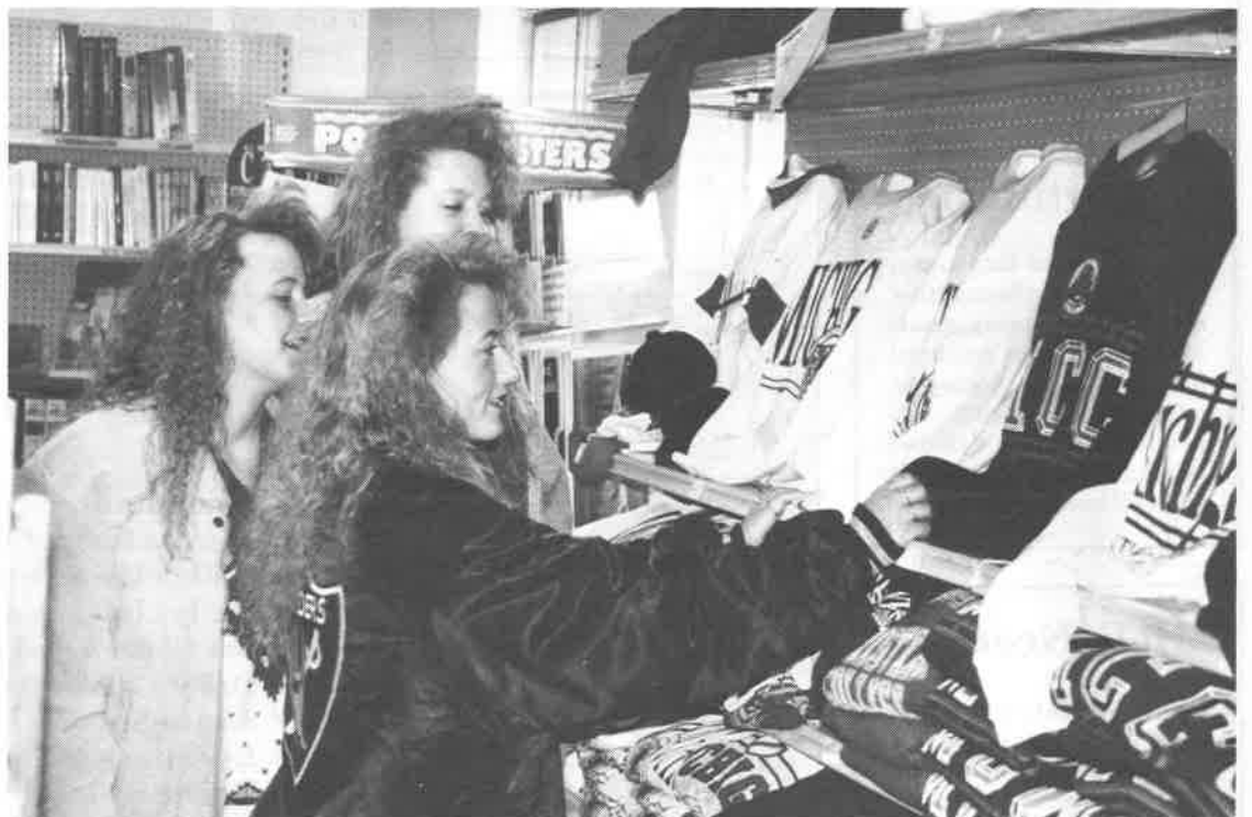
High school students from Indiana visit the campus as the college's enrollment continues to grow.

sidering enrollment next fall to complete admission and financial aid processes as quickly as possible to guarantee themselves a spot in the freshman class. Admission and financial aid information can be obtained by phoning the Admissions Office toll-free at 1-800-521-6010.