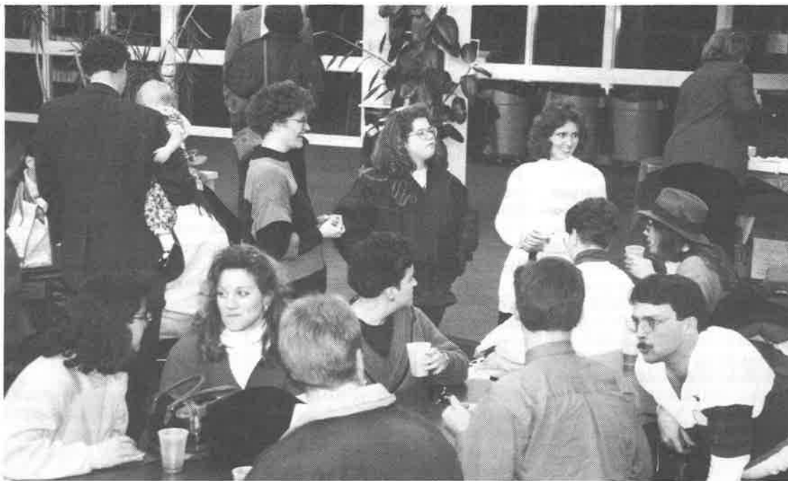
Former students visit at a reception following a Homecoming victory over Grand Rapids Baptist College.