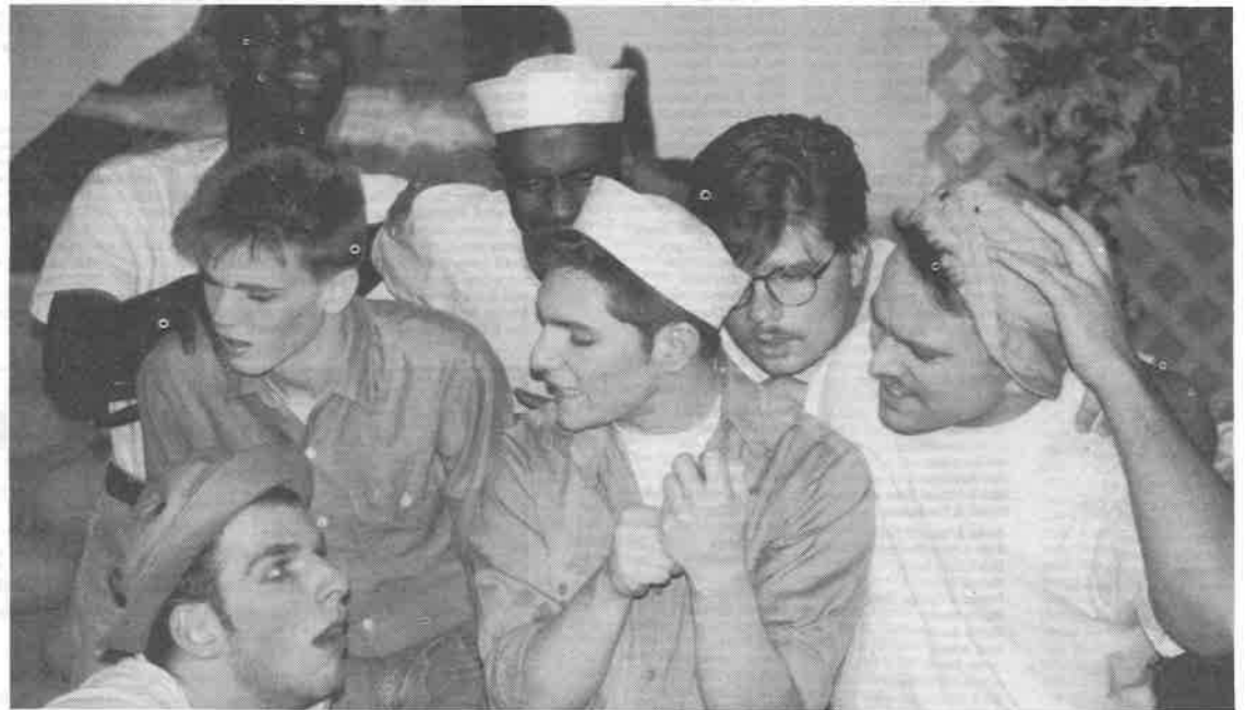
Sailors of the musical "South Pacific" plot strategies to visit the nearby island of Bali Ha'i.

In preparation for South Pacific , volunteers began transforming the Westside Central Chapel into a temporary theatre during the break between semesters. Workers removed the fixed seating from the west section of the chapel, and built movable platforms over the seating risers. After classes began, students constructed a curtained stage around the sloped platform, allowing for scene changes. By opening night, the chapel took on a completely new character.