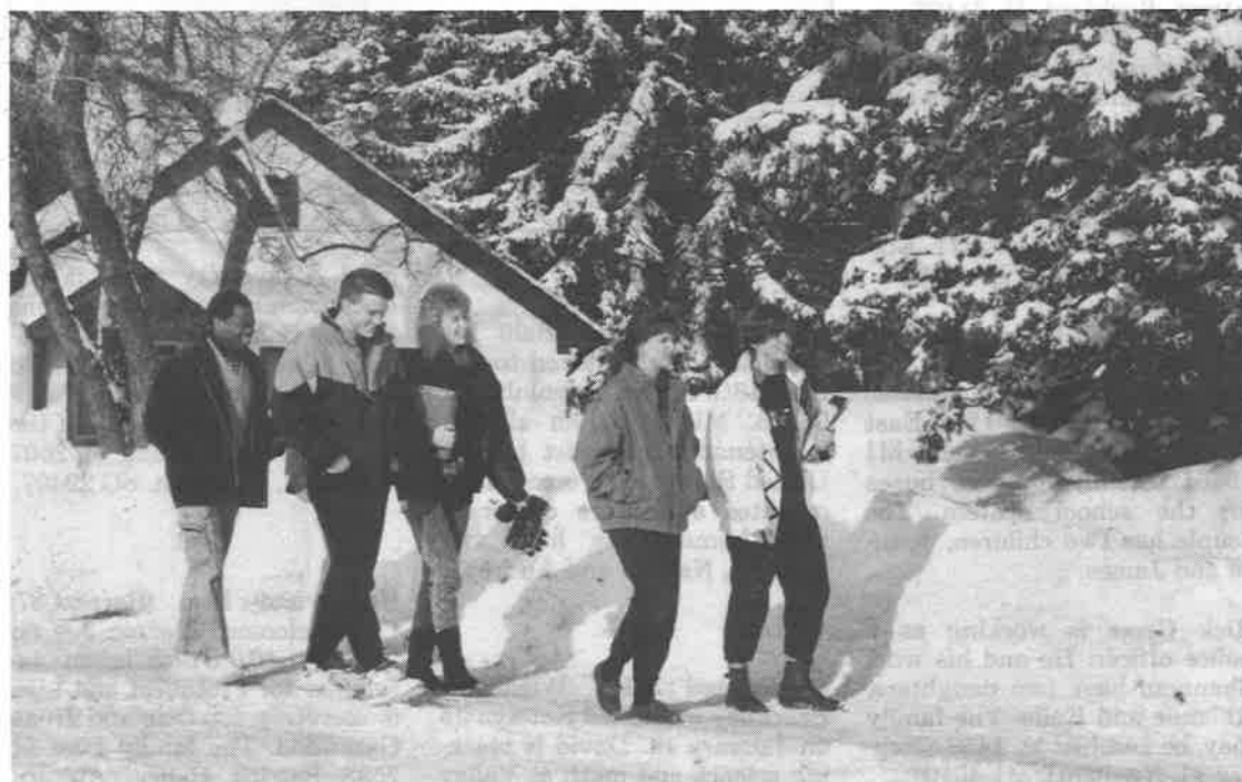
Students enjoy sunshine after a winter snow that welcomed them back for the second semester.

At the completion of the game, alumni gathered at a post-game reception, which provided time for refreshments and visiting with old friends. Although the reception provided a fitting conclusion to the event for most alumni, members of the class of 1987 extended their day with an evening dinner in the Gold Conference Room.