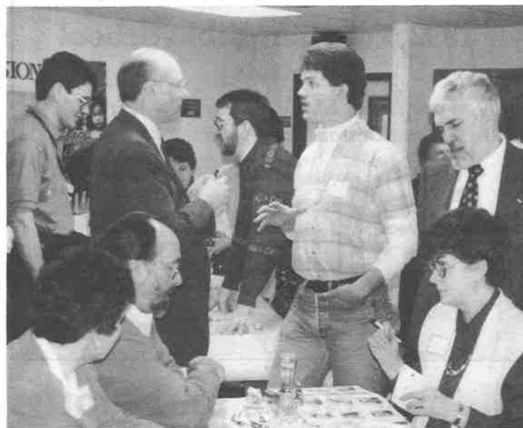
Alumni and college personnel visit at the Homecoming Luncheon.