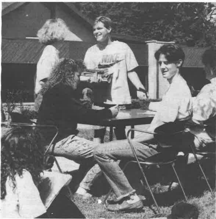
Students visit at an outdoor stop in the registration line.