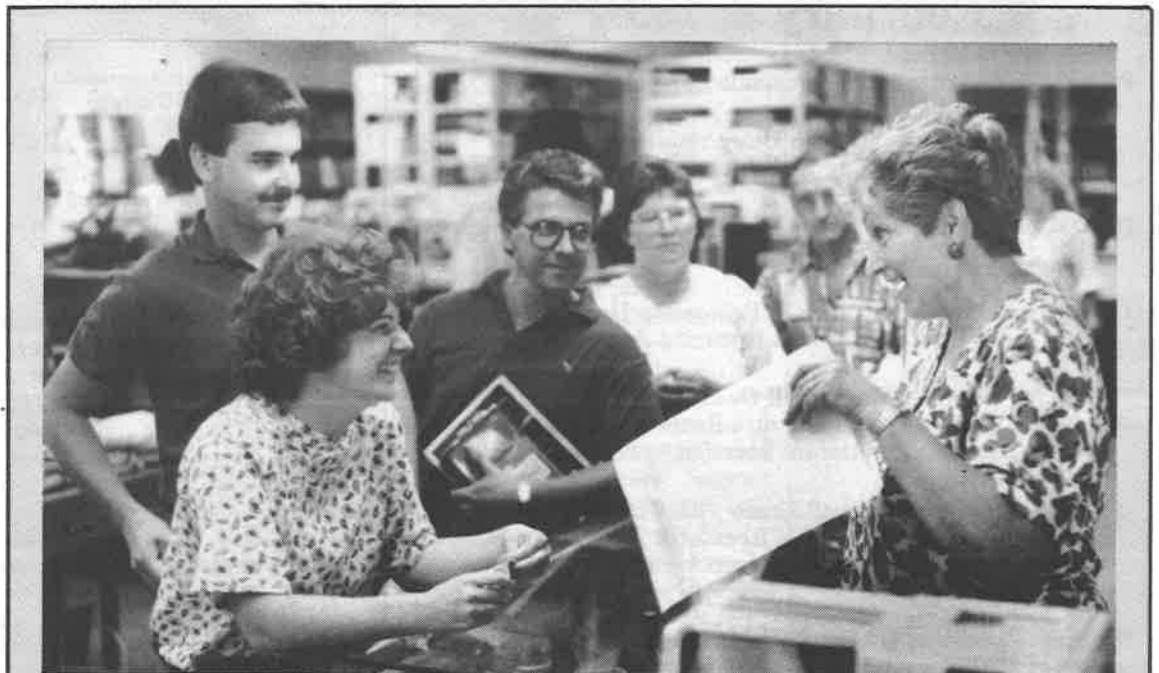
Fall Festival guests assist the scholarship program with Bookstore purchases. See page 2.

To learn if your employer will match contributions to MCC, please check the list provided on pages 4 and 5.