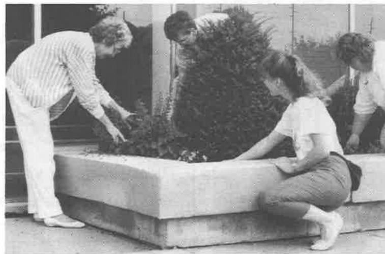
Retreat participants count flowers in front of Campus Center.