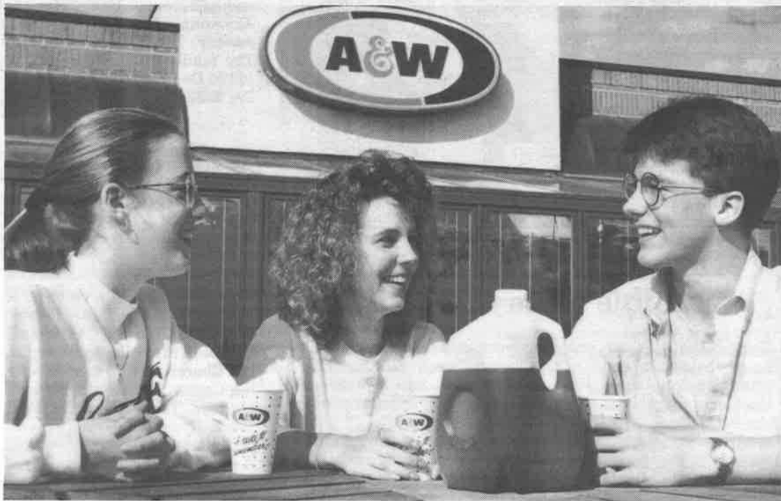
Students enjoy an old-fashioned A&W treat at one of the Rochester area's newer restaurants.