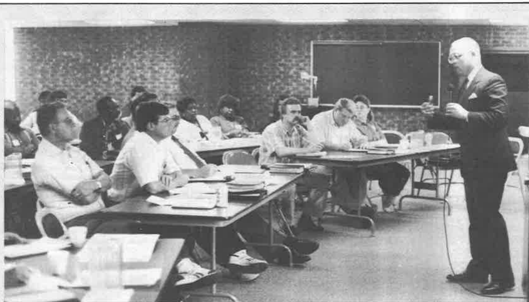
Youth Leaders from twenty-nine congregations gathered on September 8 at the Rochester Church of Christ for the Michigan Christian College Youth Leaders Workshop. The event drew seventy-one participants, the largest attendance since the workshop began in 1980.

The first Partnership Dinner took place in the college gymnasium in 1972. Since that time, annual Partnership Dinner campaigns have developed in Detroit, Chicago, and Western Michigan. Planners of Partnership Dinner Mid-Michigan have scheduled September 13, 1991 for their second dinner.