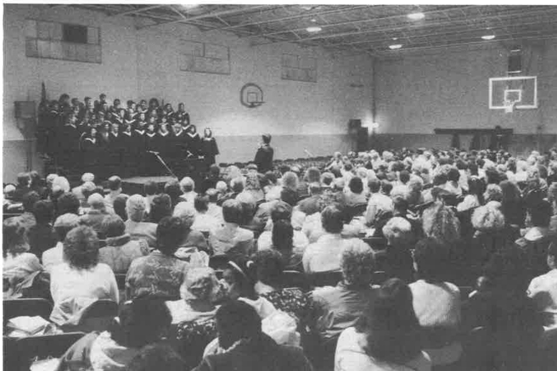
Lectureship guests listen to the A Cappella Chorus during the last session in the gym.