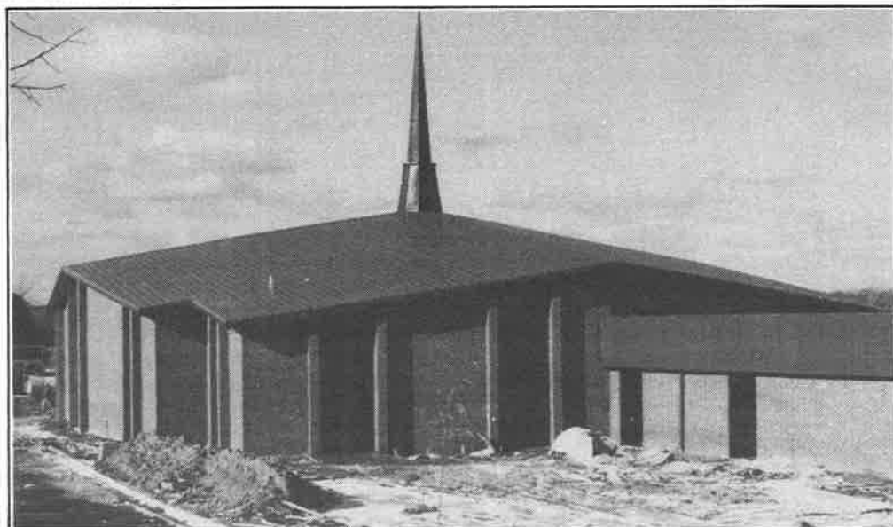
Work on a new facility for the Rochester Church of Christ continues on property bordering the east end of campus. A full story will be included in the spring issue of the North Star.