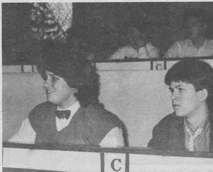
Participants in the monthly Bible Bowl competition at MCC listen to see if they have answered the question correctly.