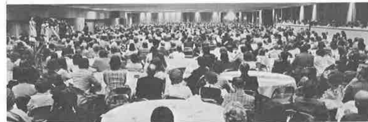
Partnership Dinner IV, 1975