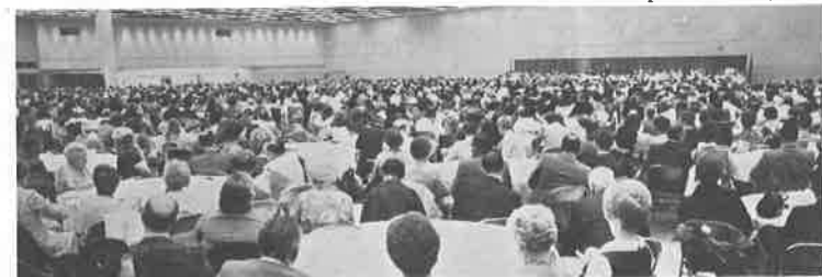
Partnership Dinner VI, 1977