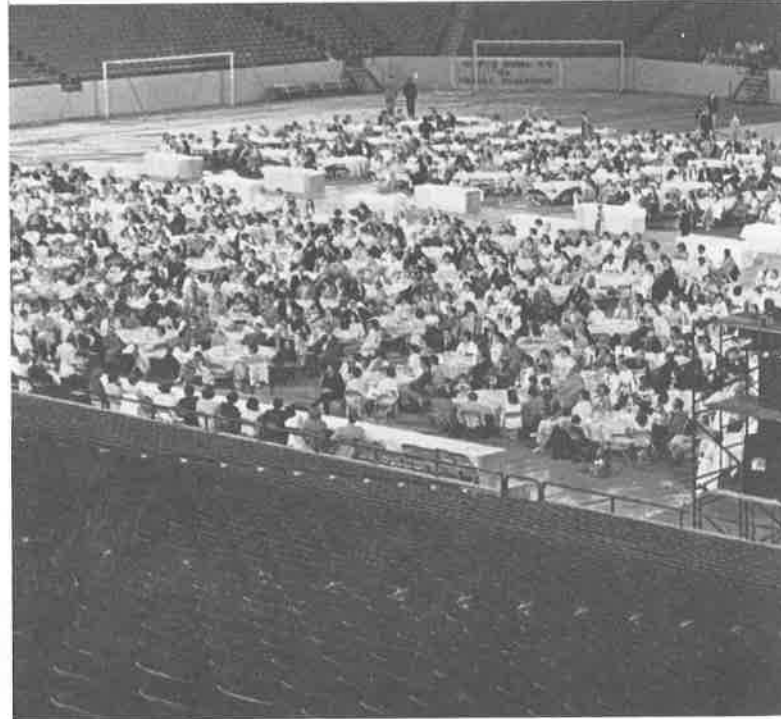
Partnership Dinner VII, 1978

Not only has Partnership Dinner developed as the largest annual gathering of Christians in the Midwest, but as the means of a balanced budget and continued growth for Michigan Christian College. No other region of the country has ever accomplished a more dramatic effort on the behalf of Christian education.