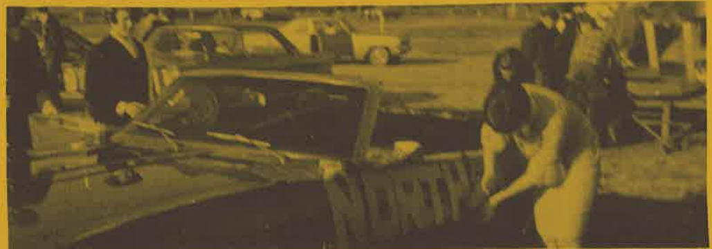
The Harvest Festival Parade through downtown Rochester begins the activities of the Annual Fall Festival. This year the date is October 5. MCC student clubs also enter floats in competition with the various auxiliary groups of the college.