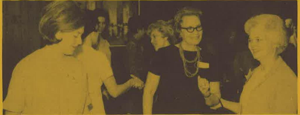
The Annual Silver Tea is scheduled for Tuesday afternoon from 3 - 5 p.m. It is sponsored by the "W"-Club and Faculty Wives of MCC. Both men and women are invited to attend. Donations to the "Wishing Well" are used to provide scholarships for qualifying girls.