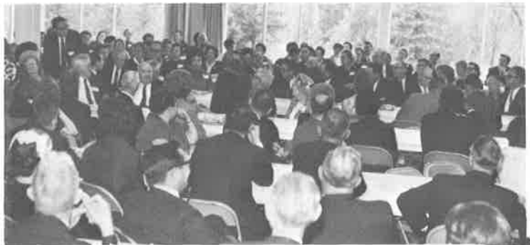
The daily luncheons enjoyed record crowds. The one above is the regular monthly luncheon of the preachers of the Detroit Metropolitan area. MCC is the host of this luncheon each October.