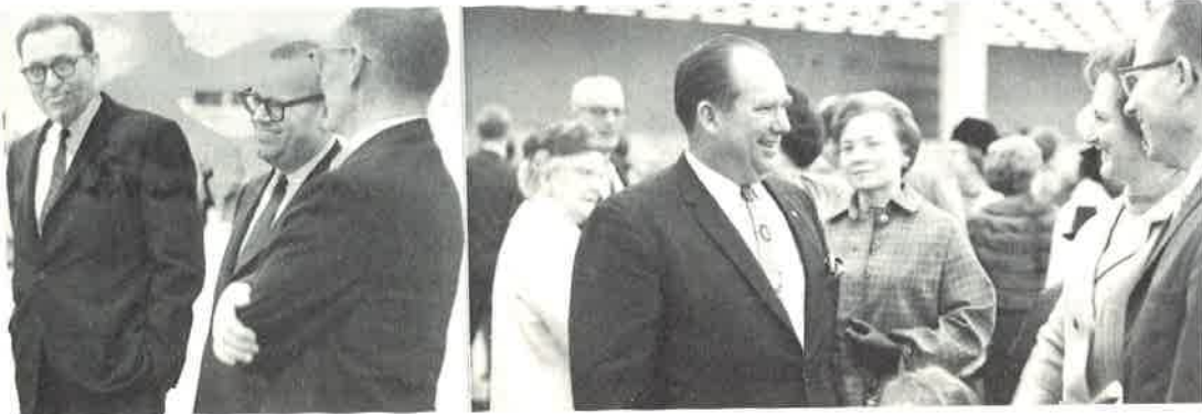
Friends of MCC attend Cobo Campaign Kickoff Meeting