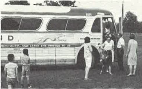
dison, Tenn. charts a bus every to come Lake Geneva. Who'll make it two?