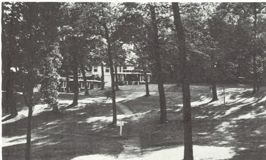
Lake Geneva cottages nestle in a beautiful setting along the shore (See page 3 for rates).

associated with the Tung-Sol Electric Company, and for thirty years was manager of the Detroit and Columbus (Cont'd Page 2)