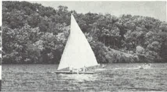
"Sailing, sailing..." is one of the water sports offered at Lake Geneva Encampment.