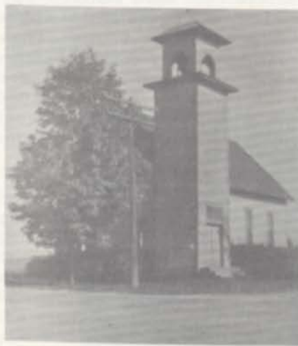
BUILDING BEFORE REMODELING