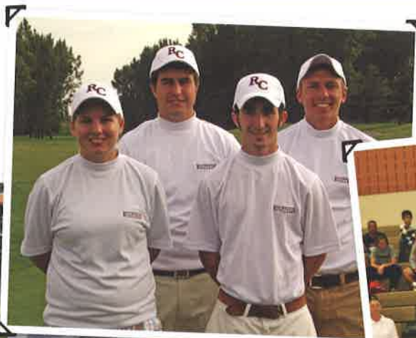
◀ Four new freshmen joined the golf team