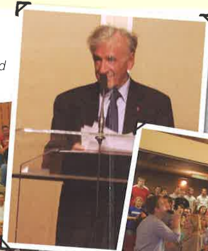
◀ Our 50th-year celebration kicked off with a thought-provoking speech by Holocaust survivor, author, and Nobel Prize winner Elie Wiesel