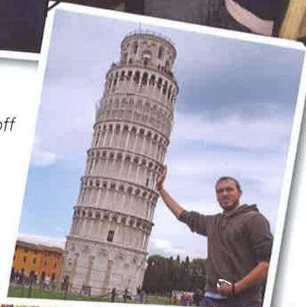
GEO Vienna group 2008