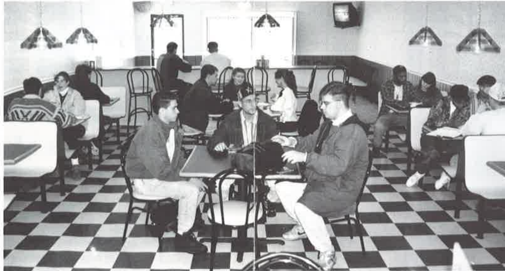
Students enjoy visiting with one another in the comfortable surroundings of the new Warrior Cafe.

The Warrior Cafe is flanked by two tall counters with stools. In addition to providing a place to eat, one functions as a service counter. The other divides the eating area from a carpeted area designed for watching