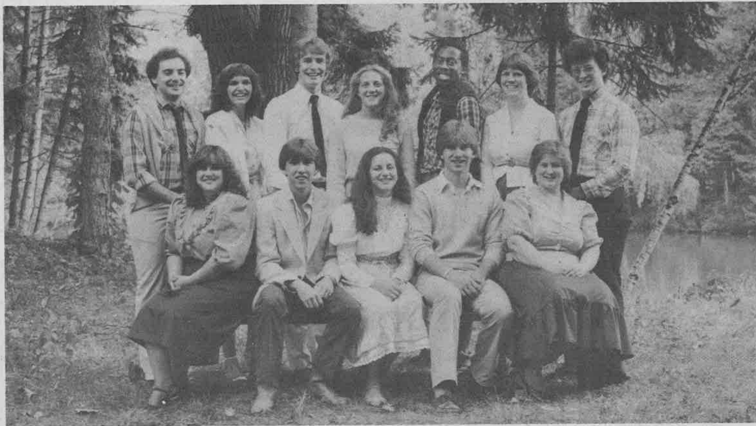
Twelve students will make up the 1982-83 edition of Autumn. Because of the tremendous, positive response to the contemporary religious music style of the Autumn program for the past year, this year's group is working to continue that tradition of excellence.

At the close of the registration period, 346 students had enrolled for the fall semester. This number included 312 full time and 34 parttime students. Seventeen states and two foreign countries were represented in the student body. These included: Alabama, Connecticut, Georgia, Illinois, Indiana, Iowa, Kentucky, Michigan, Mississippi, Missouri, New York, Ohio, Pennsylvania, Tennessee, Virginia, West Virginia, Wisconsin, Hong Kong, and the West Indies.