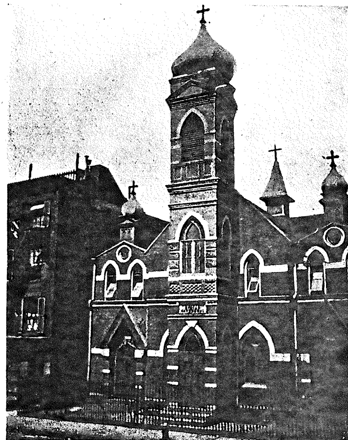
SYRIAN CATHEDRAL OF ST. NICHOLAS, BROOKLYN, N. Y.

The Syrian Orthodox Church is part of the Eastern Communion to which the Greeks belong, and possesses the same ritual and doctrine, though there is a strong